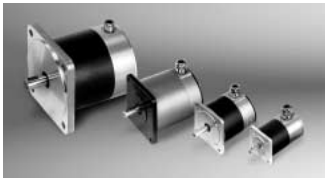
SM 168 SM 107 SM 87/88 SM 56

All printed torque performance curves are measured with STÖGRA drives .