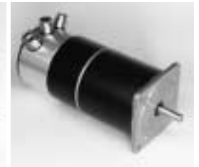
SM 87.2 with brake and encoder H200