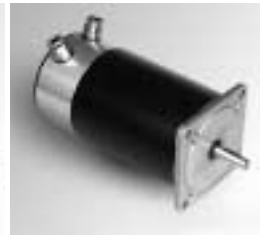
SM 87.3 with encoder H200