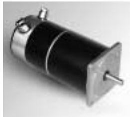
SM 87.2 with brake