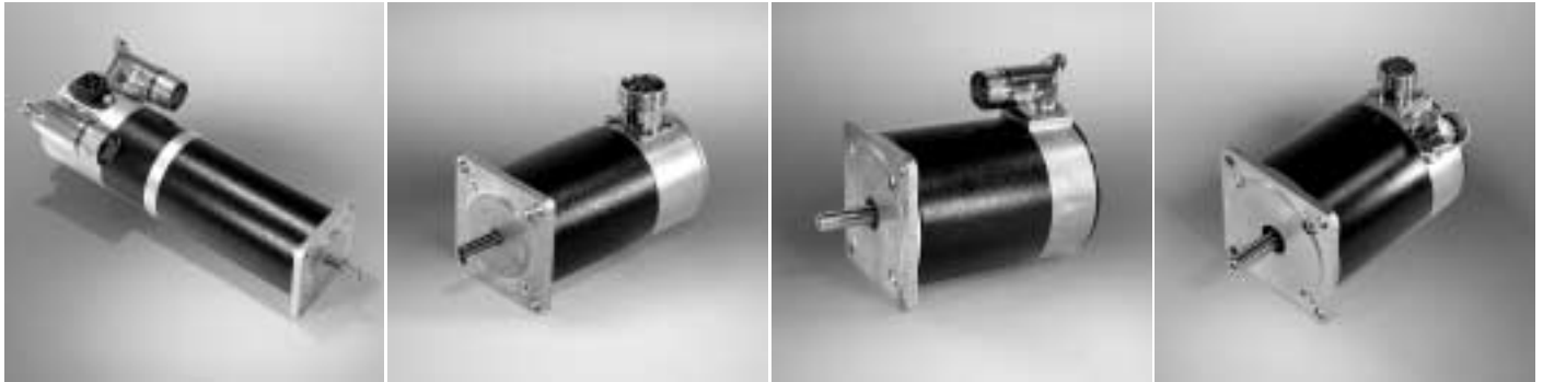
SM 56.3.18JX4,6B E50 with angled connectors series SM ...X...

Available are standard versions with angled connectors series SM ...X... and with straight connectors series SM ...Y... (the connector for the brake connection ist always straight).