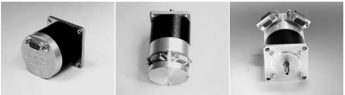
SM 56...Z154 with D-Sub connector