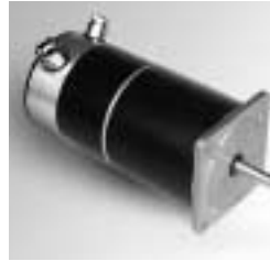
SM 87.2 with brake