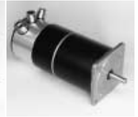
SM 87.2 with brake and encoder H200