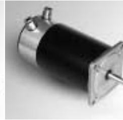
SM 87.3 with encoder H200